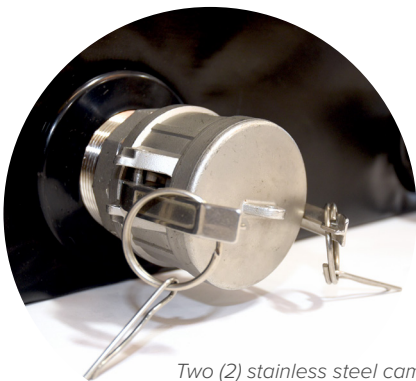
Two (2) stainless steel camlock fittings allow quick and leak-free drainage of spilled chemicals.