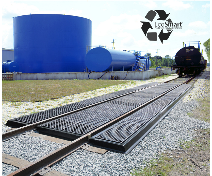
System shown includes one Center Pan (Part# 7200) and two Side Pans (Part# 7210)