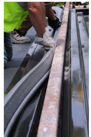
Optional rail side gaskets prevent leaking between rails and Track Pans.

Visit www.trackpans.com for more detailed information.