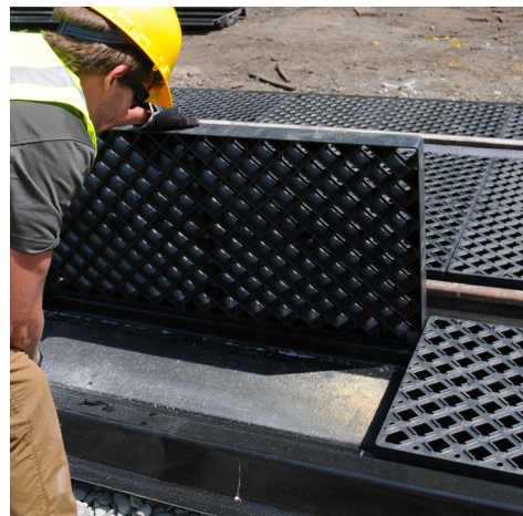
Optional polyethylene grating package available for safer foot traffic.