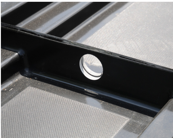
Optional flow through technology increases containment capacity for larger spills while minimizing cleanup of smaller spills.