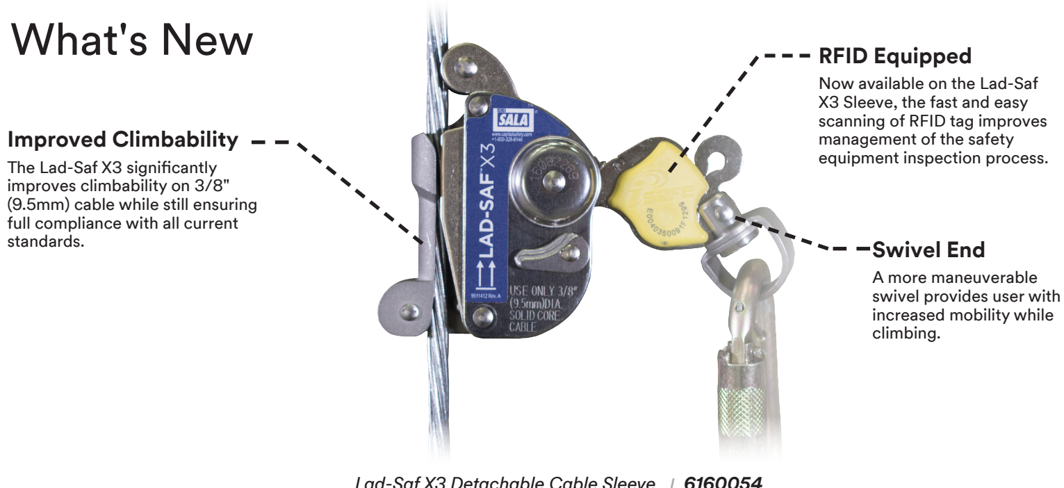
Lad-Saf X3 Detachable Cable Sleeve | 6160054 Not Intended for use on 5/16" (8mm) cable

The Lad-Saf X3 Detachable Cable Sleeve exclusively for 3/8" (9.5mm) cable, with dual independent locking systems, is part of a permanently installed ladder safety system. It is designed to work with many different styles and lengths of ladders on structures like wind turbines, communication towers, buildings, water towers and more.