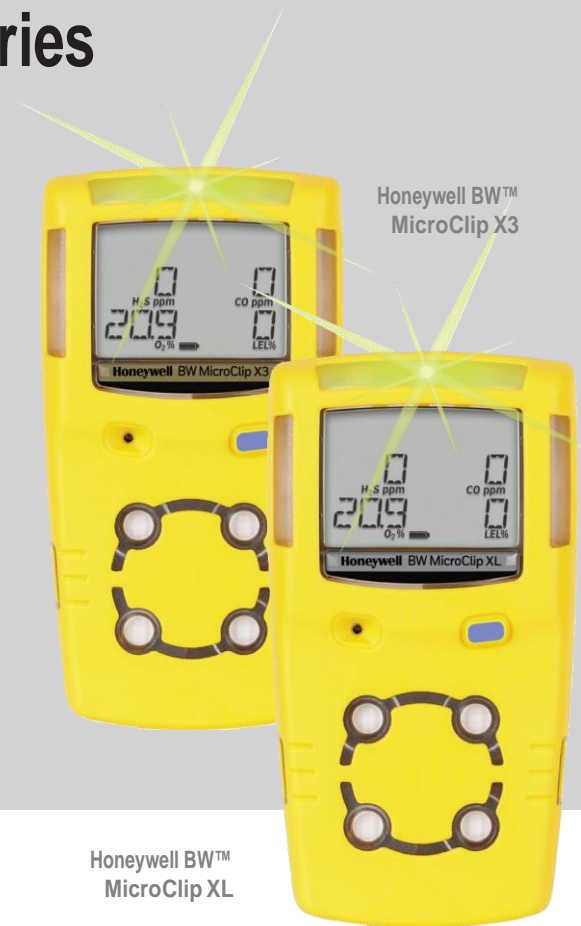
Honeywell BW™ MicroClip XL

For a complete list of kits and accessories, please contact Honeywell Analytics.