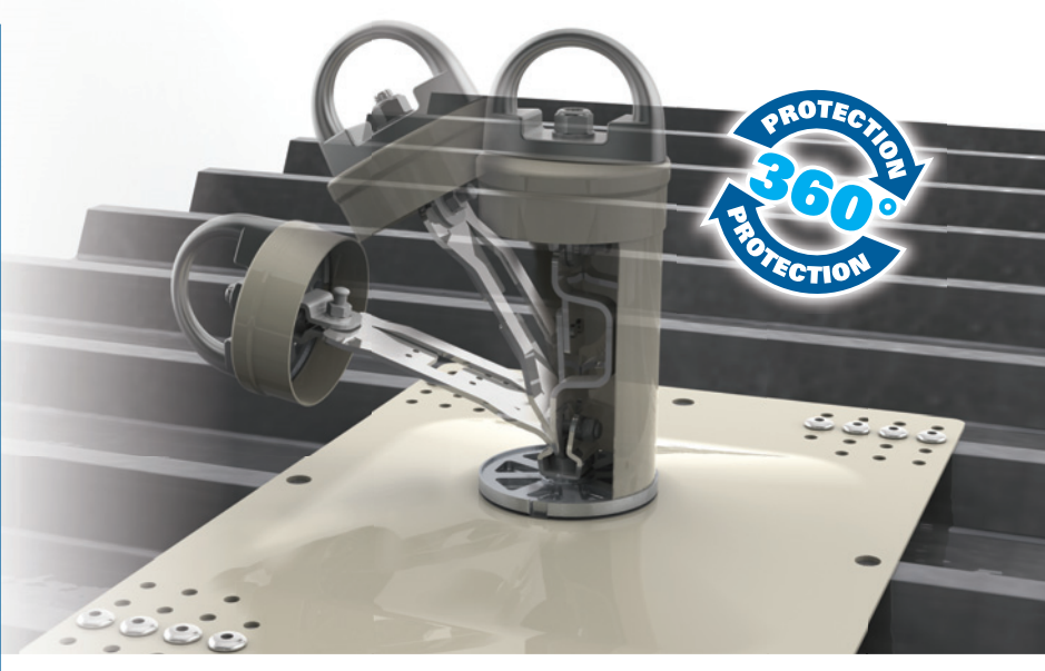
In the event of a fall, the Miller Fusion Roof Anchor Post orients in the direction of the force, the built-in, energy-absorbing component activates and the base remains securely attached to the roof surface.