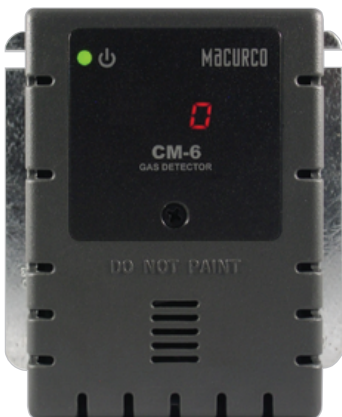
Grey Housing (Standard)