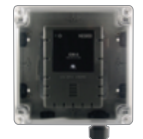
Weatherproof Housing Kit (Detector sold separately)