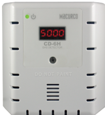
White Housing Option

The Macurco 6 & 12 Series fixed gas detectors provide life-saving solutions aimed to protect people and property. These fixed gas detectors are designed for low level detection, mitigation, and notification. Let these detectors do the work for you by shutting off valves, turning on fans, engaging horns and strobes, and provide notification to fire panels and building automation systems when gases reach key limits.